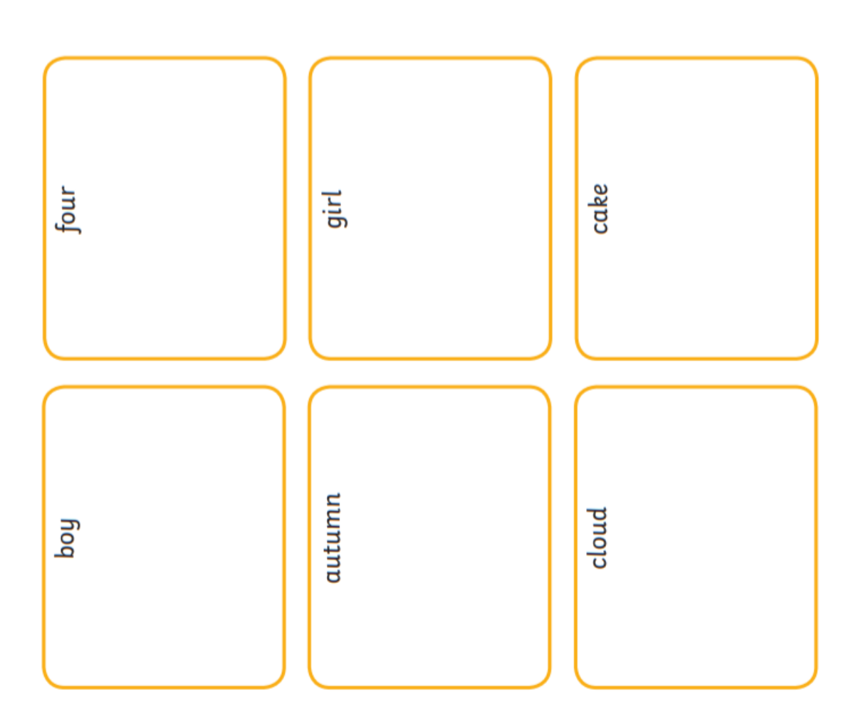
Activity 2: Write the split diagraph words to match the pictures